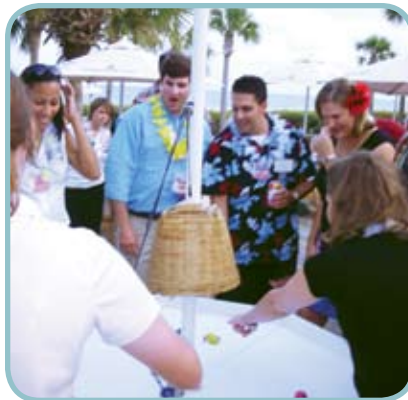
Guests at Friday night's Luau Dinner cheer on their favorite crab during “Crab Races for Charity”